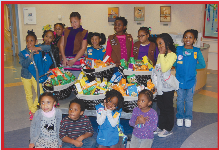
Mt. Zion's Girl Scouts donated over 200 boxes of cookies to the families at the Neonatal Intensive Care Unit (NICU) at Vanderbilt's Children's Hospital.