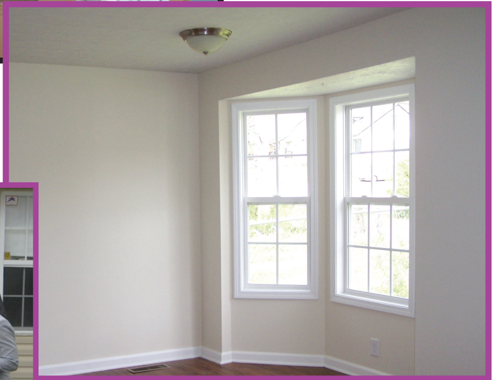
ABOVE: After picture---Foreclosed home purchased by New Level CDC LEFT: Bank award to New Level CDC and members of North Nashville Coalition