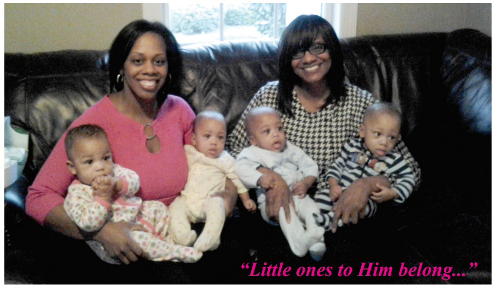
"Little ones to Him belong..."