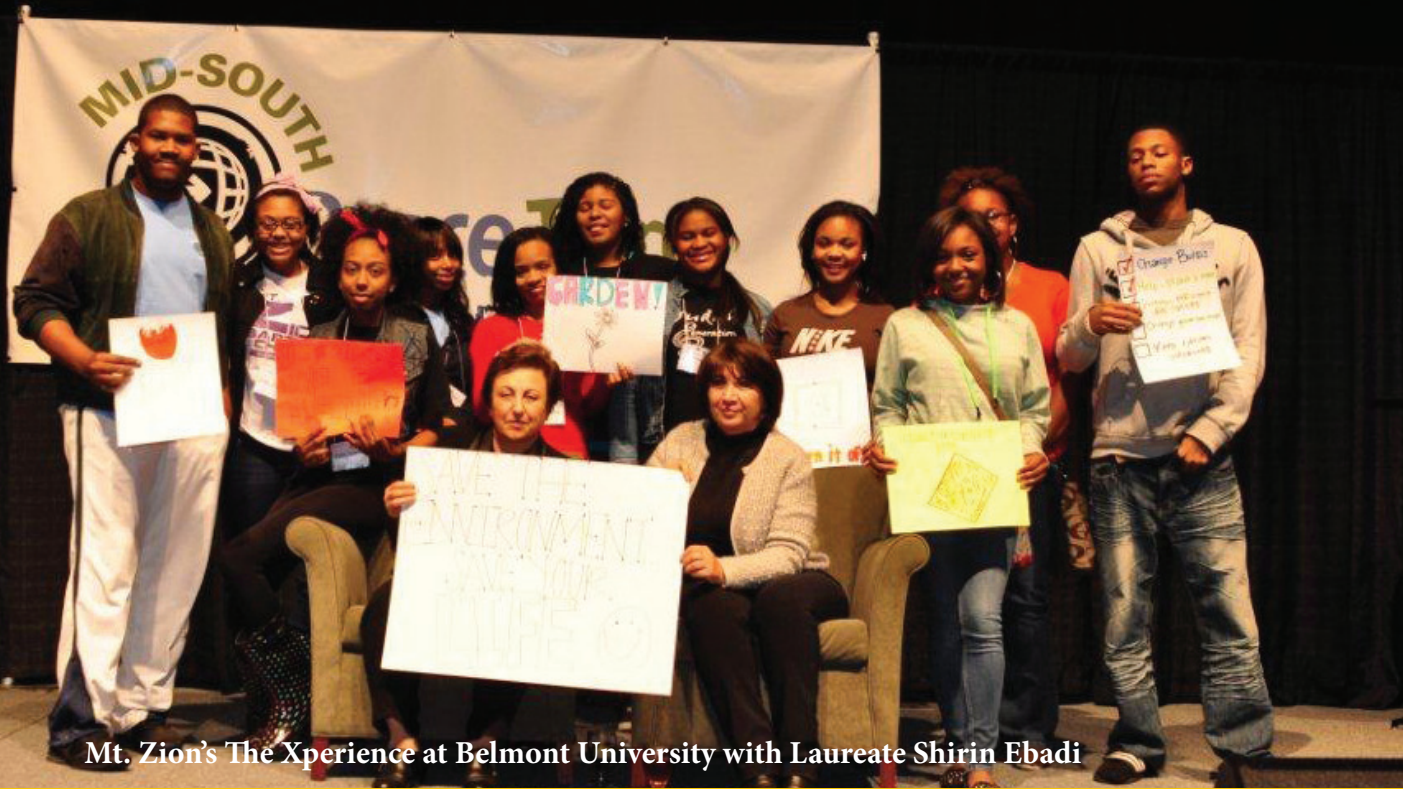
Mt. Zion's The Xperience at Belmont University with Laureate Shirin Ebadi

If you like running, you can run in "Relay For Life." If you like cooking, you can be a chef for homebound seniors. Most women know that when they look good, they feel better. Consequently, why not host Room In The Inn for 12 females who have no permanent home? These guests are pampered when they get their hair styled and their nails and feet groomed.